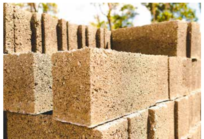
Declared building products include ecological criteria, building physics and building ecology parameters and product group-dependent properties.

In baubook you will find tested products, reference and characteristic values, manufacturer information, criteria and platforms.