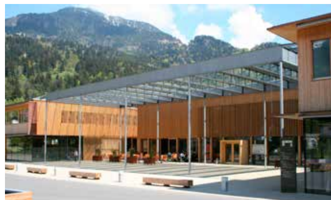
Community centre Ludesch

Vorarlberg's municipalities have implemented over 100 new construction and renovation projects according to these standards in recent years.