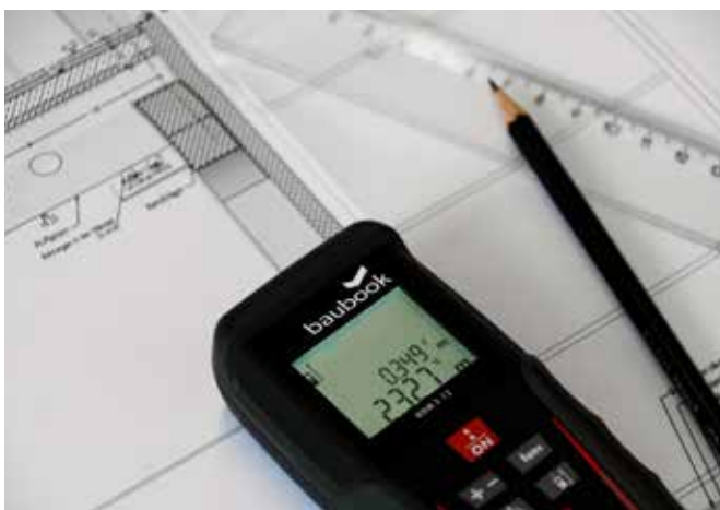
The core of baubook contains comprehensive product database as well as useful tools for the calculation of various building indicators.

baubook is a database for building products. It simplifies ecological and healthy building and facilitates verification within the framework of ecological tenders, building certifications and funding systems. baubook provides validated and structured building material data for the calculation of energy and ecological indicators.