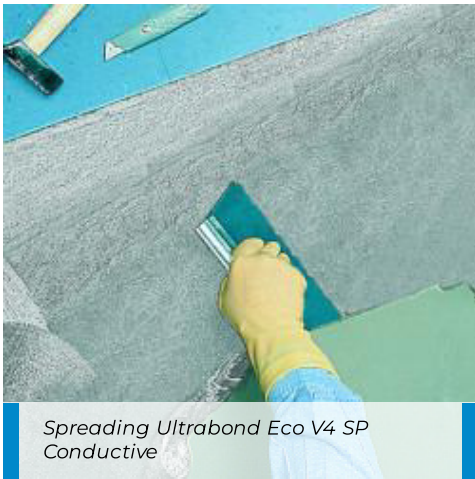
Spreading Ultrabond Eco V4 SP Conductive