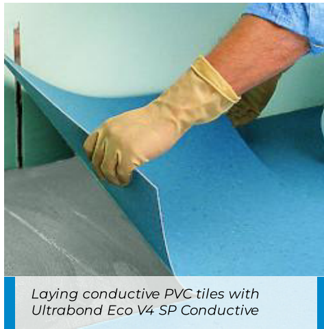
Laying conductive PVC tiles with Ultrabond Eco V4 SP Conductive